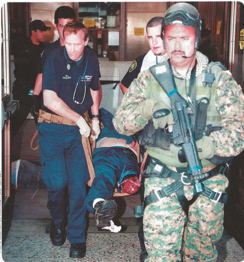
There are many situations (hostile environment, life threatening injuries) where spinal immobilization may be detrimental to good patient care. This training scenario emphasizes rapid extrication.